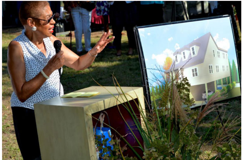
Congresswoman Eleanor Holmes Norton at Public Showing of Mary's House

MHFOA will develop brick and mortar housing targeting the cultural and relational needs of lesbian, gay, bisexual, transgender, queer/same gender loving (LGBTQ/SGL) elders. Our first communal living home will be built in Washington, DC. Our vision is to build a Mary's House in every ward in the District of Columbia as well as every state and territory in the Union. We know that there is not enough affordable and culturally competent housing available to older adults, especially for LGBTQ/SGL people. Therefore, we educate on and advocate for issues germane to elders, LGBTQ/SGL elders in particular, emphasizing their issues, including the lack of safe and affordable housing as a public health issue.